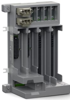
ABB Ability™ System 800xA® hardware selector

Select I/O is an Ethernet networked, single channel granular I/O system for the ABB Ability™ System 800xA automation platform. Select I/O helps decouple project tasks, minimizes the impact of late changes, and supports standardization of I/O cabinetry ensuring automation projects are delivered on time and under budget.