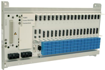
ABB Ability™ System 800xA® hardware selector

S900 is a remote I/O family designed for applications with hazardous-rated areas according to ATEX. The I/O system can be safely located directly in ATEX Zone 1 and 2, saving wiring and signal conditioning costs.